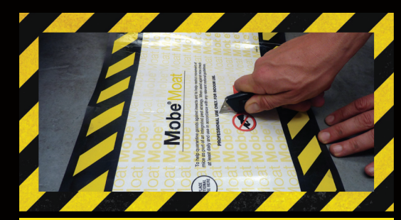
MoBe Moat can be cut to fit any situation